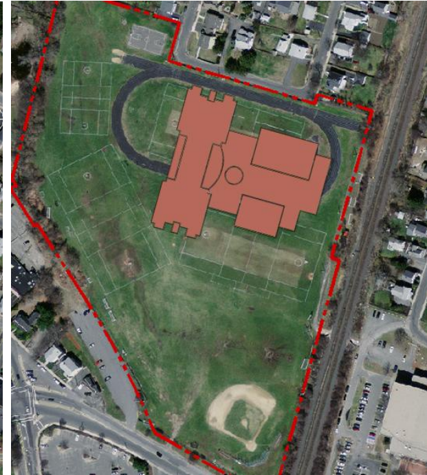
Alternative 7a Project Cost: $163 Million Alternative 7b Target Project Cost: $150 Million Alternative 7c Target Project Cost: $140 Million Schedule: 2 - 2.5 years