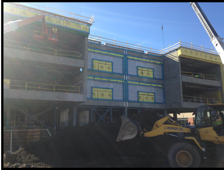
Bldg C North Façade