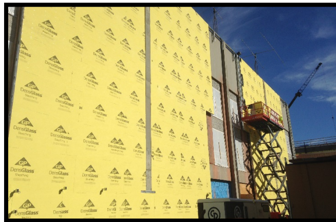
Bldg E South Façade