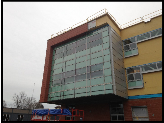
Bldg C North: Terracotta at Curtain Wall