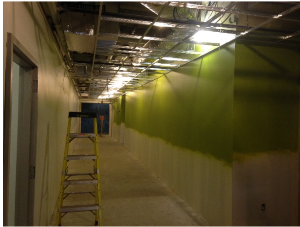
Bldg C Level 2 – Corridor Paint & Ceiling Grid