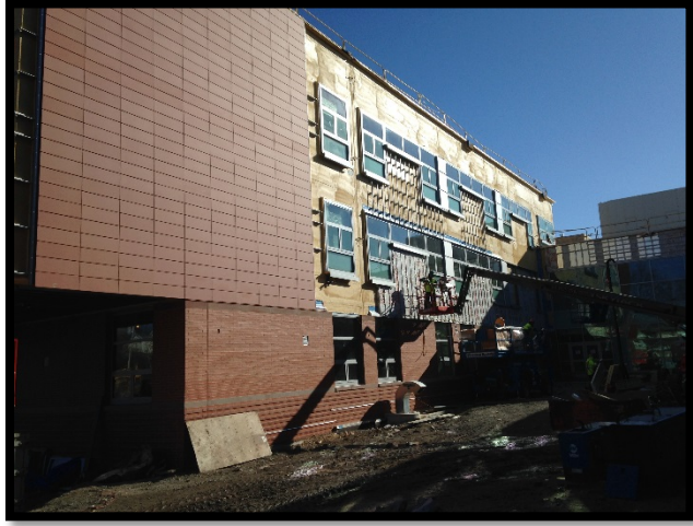
Bldg C West: Arrsicraft Veneer Installation