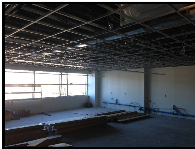
Bldg C Classrooms – Light Fixture & Ceiling Grid Install