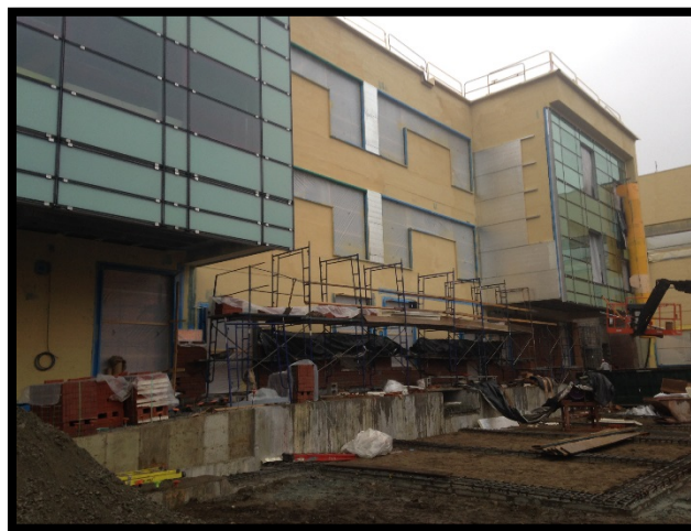
Bldg C North – Loading Dock and Brick Install