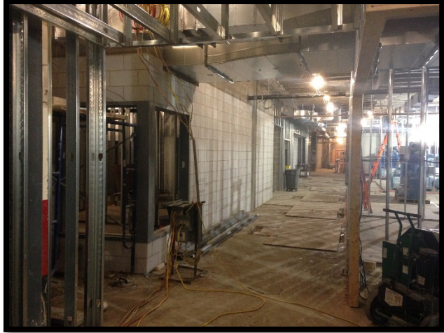
Bldg E Level 1: Locker Room Corridor