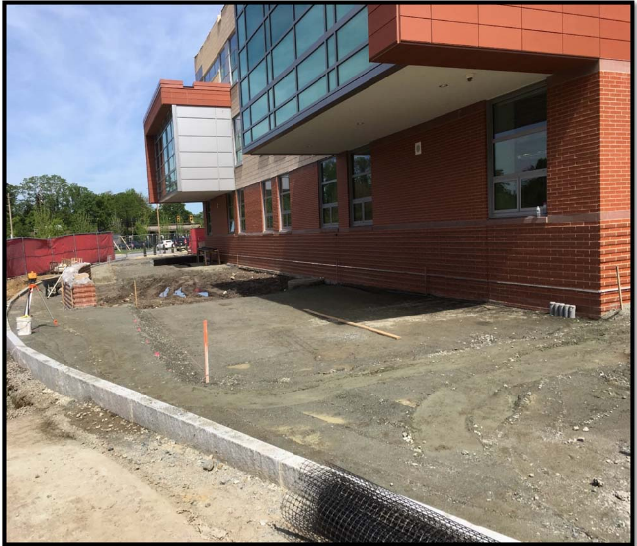
Bldg A South: Prepping/Subgrading for Concrete Plaza