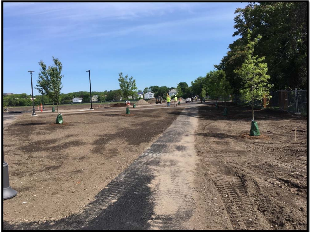
Skillings Field: Installing Trees, Bollards, & Top Soil