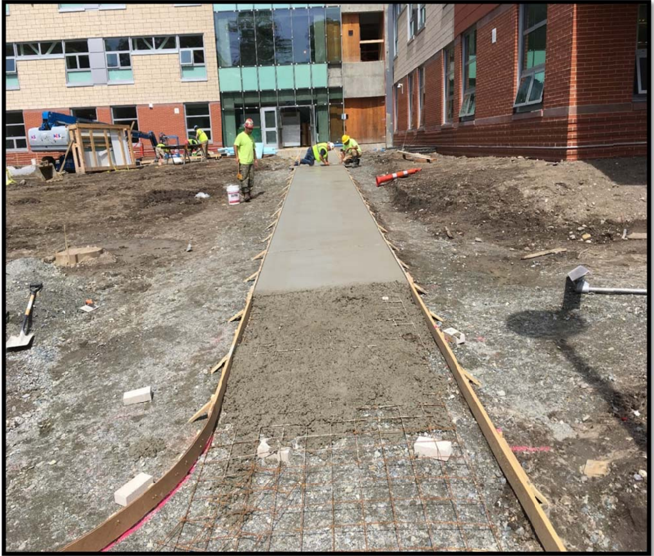
Bldg A East: Pouring Concrete Walkways to Entrances